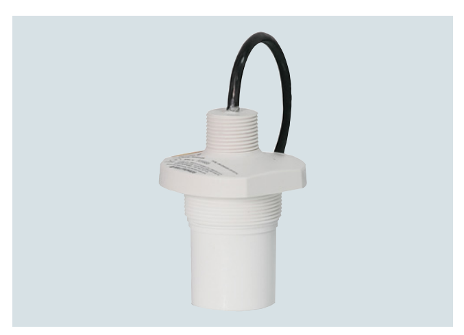
ST-H transducers use ultrasonic technology to measure level in chemical storage and liquid tanks.