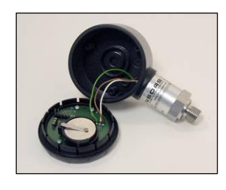
Abb. 4 battery case