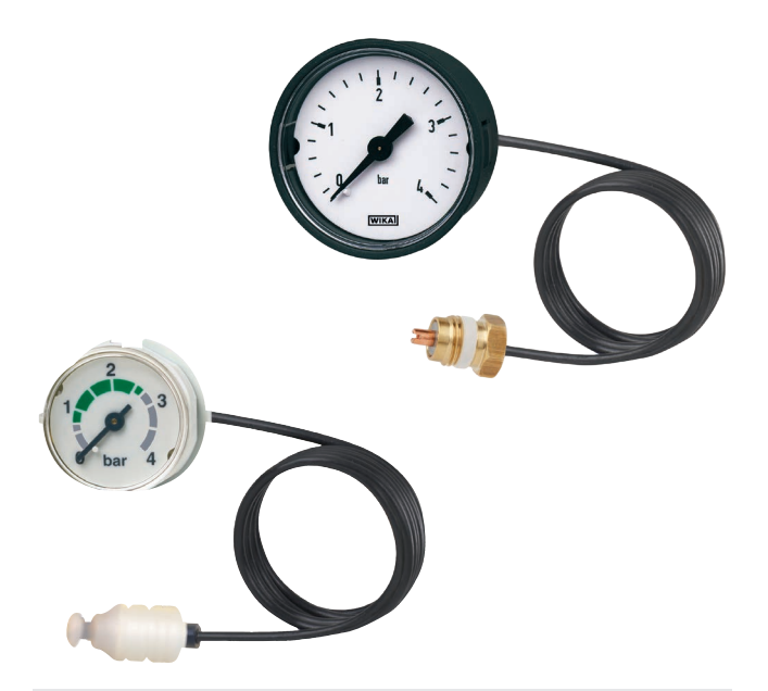
Fig. left: Model 101.12 with plug connection Fig. right: Model 101.00 with G 1/4 B