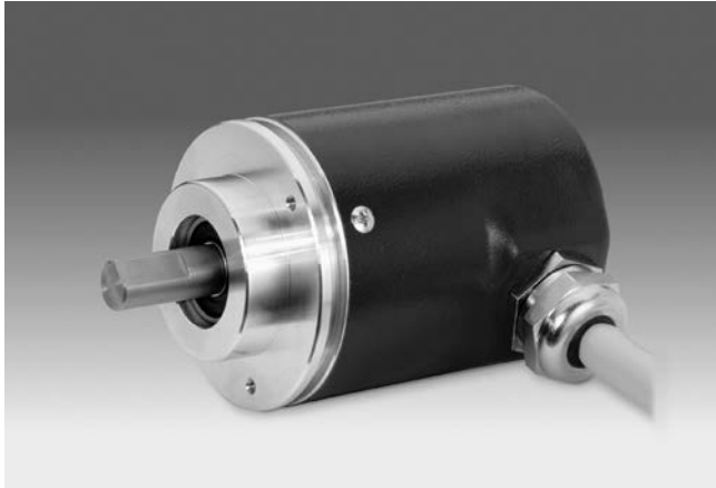
GXN1W with clamping flange