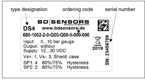
Fig. 1: Manufacturing label

The device can be identified by its manufacturing label. It provides the most important data. By the ordering code the product can be clearly identified.